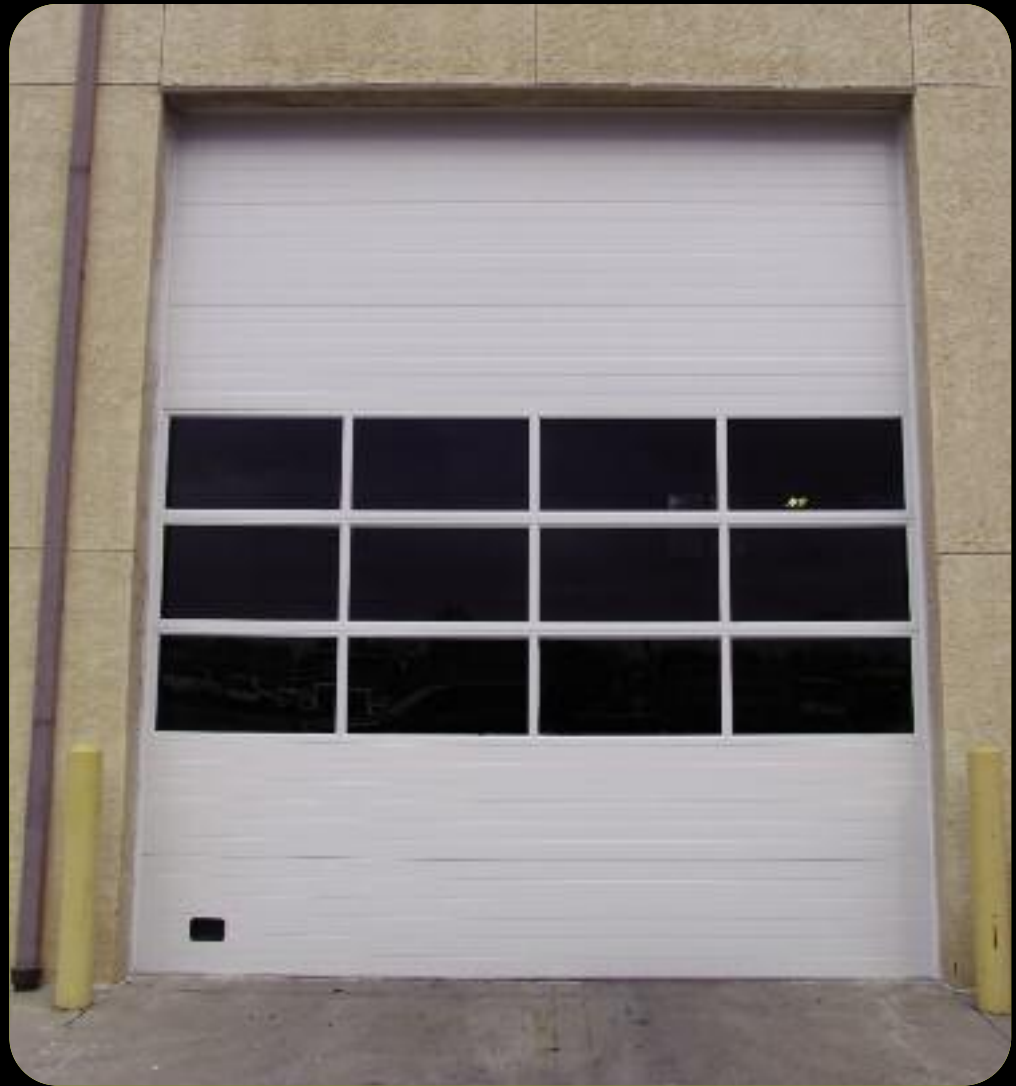
ThermaSeal TM175 with full-view windows