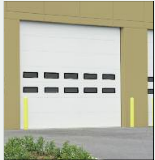
ThermaSeal TM175, white, with rectangular windows

Rust-resistant galvanized steel is finished with a two-coat, baked-on paint process for long life. The superior thermal bond between steel and polyurethane foam is warranted against delamination for 10 years.